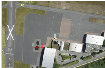
6208x8280 Pixel, 306 m AGL, 1/1600., f8

The maiden flight was performed on June 23, 2016, in Bremerhaven, at the no-longer-active airport Luneort. The S360 initially flew in the main direction at 210 m above ground level (AGL) and then again in the transverse direction at 310 m, allowing for a later boresight calibration of the camera based on the made photos. The camera was triggered every 75 m by the flight computer. For each image created, the positioning and orientation data from the APX-15 UAV was read by the iXU150 and stored in the header of the photo. Simultaneously the APX-15 UAV stored the data and ID into its internal memory. After the flight, the data was post-processed and corrected using the included Applanix POSPac UAV software and its Smartbase module, and Trimble VRS Now resulting in a final accuracy of 2 cm without GCP's.